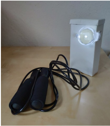
Figure 1: Reminder object placed next to skipping rope to exercise.